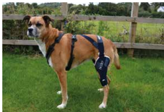
Figure 3. A Balto Knee Brace was worn for 16 hours a day as part of a treatment plan to avoid surgery for a damaged cruciate ligament.

Prior to the use of the brace, the patient's recovery was good but due to her high energy levels on two occasions progress was set back. Since using the brace setbacks (where the patient was non weight bearing) have been minimal, and mus-