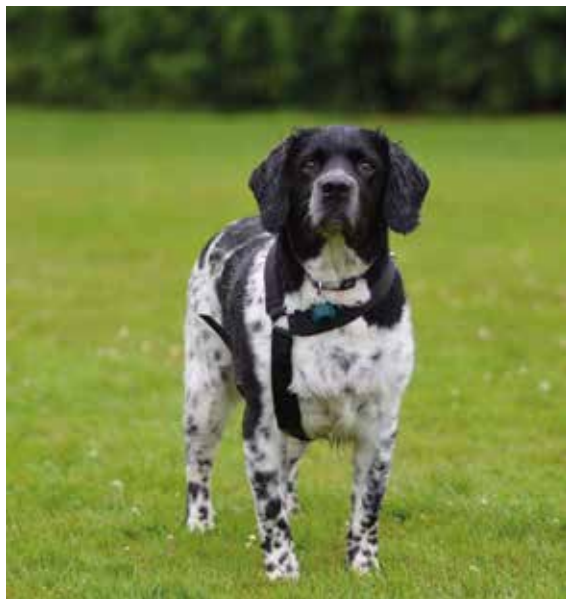
Figure 2. Max, an 10-year-old Springer Spaniel, presented with pain as a result of osteoarthritis, and a resultant reduced ability to exercise. A Balto Knee Brace was supplied for use during exercise.