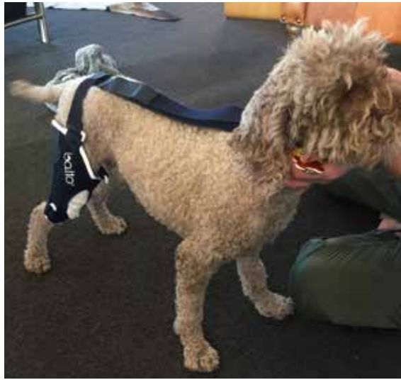
Figure 4. This poodle with cranial cruciate rupture and patella subluxation has avoided surgery through use of the Balto Knee Brace.