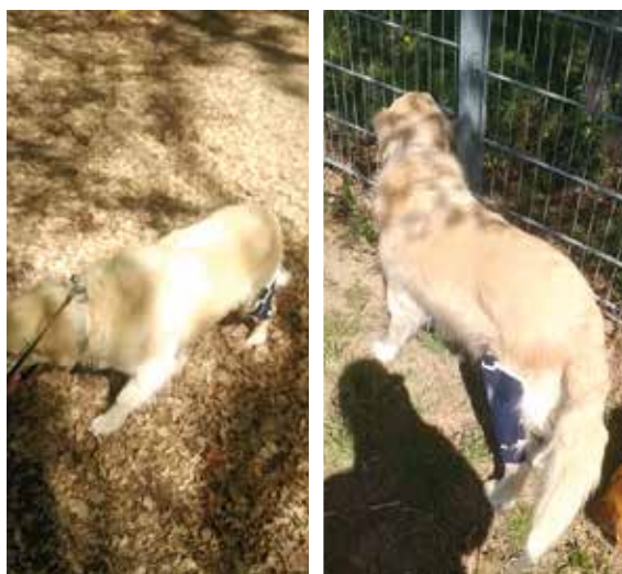
Figure 6. Tyson with the Balto brace in place.

It is important that the brace fits comfortably and without slipping, however some coat types and shapes are more prone to slipping than others. Owners should be told to come back to the practice for help if there are any concerns and the veterinary surgeon can contact KVP (info@KVPeu.com) if they are having problems troubleshooting.